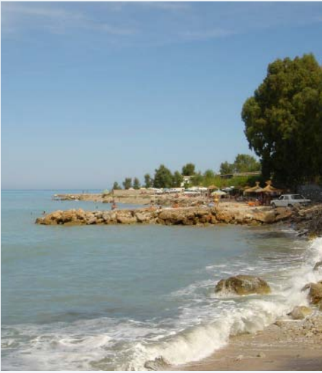
Beach in Radhima