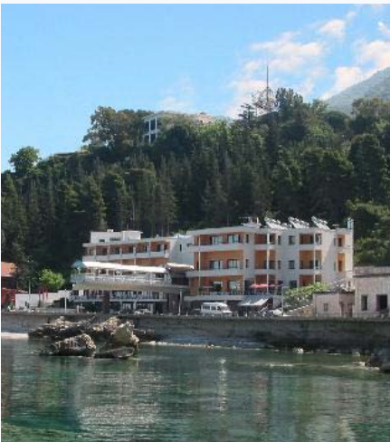
New York Hotel in Vlora

■ In Vlora we will stay in the New York Hotel. It is located in a very attractive part of Vlora Bay also known as the "Cold Water" area because of the fresh water springs nearby, which empty into the clear blue waters of the Ionian sea. Hotel New York has always been one of the best hotels in Vlora both in amenities and especially by the high standard services it offers.