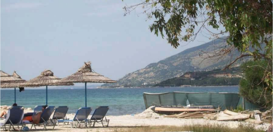
Beach in Radhima

Radhima is situated in an intermediate position on the only road that connects Vlora with Orikum, Himara and Saranda. Historical points of interest such as Vlora, Kanina, Amantia, Mavrovo, Orikum, Himara can be visited . Historical data and many archaeological sites give evidence that the region has been among the most civilized in southern Albania.