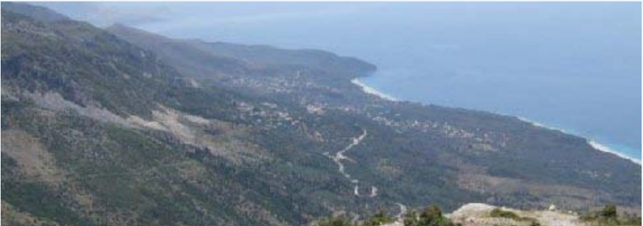
View of the coast from Llogara pass

Air currents around the area have caused trees to bend in many interesting shapes, like the Pisha e Flamurit (Flag Pine). The area of the park and the surrounding mountains are mainly used for hiking and tracking tours. An internationally known paragliding site is located south of Llogara. Along the curvy road are also located several local vendors of honey and mountain tea. Caesar's Pass (Qafa e Cezarit), named after Julius Caesar who set foot in the area in pursuit of Pompey, is also located near the Llogara Pass.