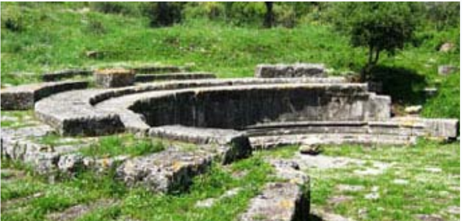
Orik Archaeological Park