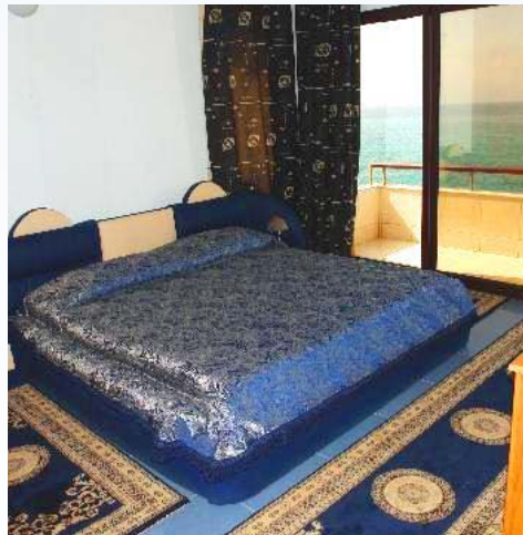
Room at New York Hotel in Vlora