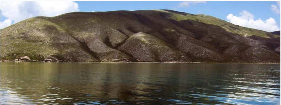
View of Karaburun

The Karaburun-Sazan National Marine Park is the only national marine park of Albania. The park covers a marine area stretching 1 nautical-mile (1.9 km) along the coastlines of Karabu Peninsula and the Sazan Island near the Bay of Vlora. The marine park is 16 kilometres (9.9 mi) long with a width varying from 3 to 4.5 kilometres (1.9 to 2.8 mi), and covers 12,428 ha of surface in total. The Karaburun Peninsula is a managed Nature Reserve and Sazan Island is a military zone. A portion of the marine and terrestrial areas of the Karaburun peninsula around the Pasha Liman Lagoon and the harbor of Sazan Island constitute military zones (Pasha Liman Base).