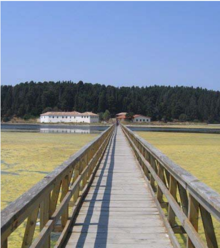
View of Zvernec Monastery from the bridge

The Monastery of Zvernec is a very important cultural monument. It was built in the thirteenth century in Byzantine style and is dedicated to St. Mary. It is located in the centre of the island. Every August 15th, there is an Orthodox celebration to commemorate the birthday of the Holy Mary. The Church of Holy Mary is annexed to the monastery and dates also from the thirteenth century. It is surrounded by evergreen trees.