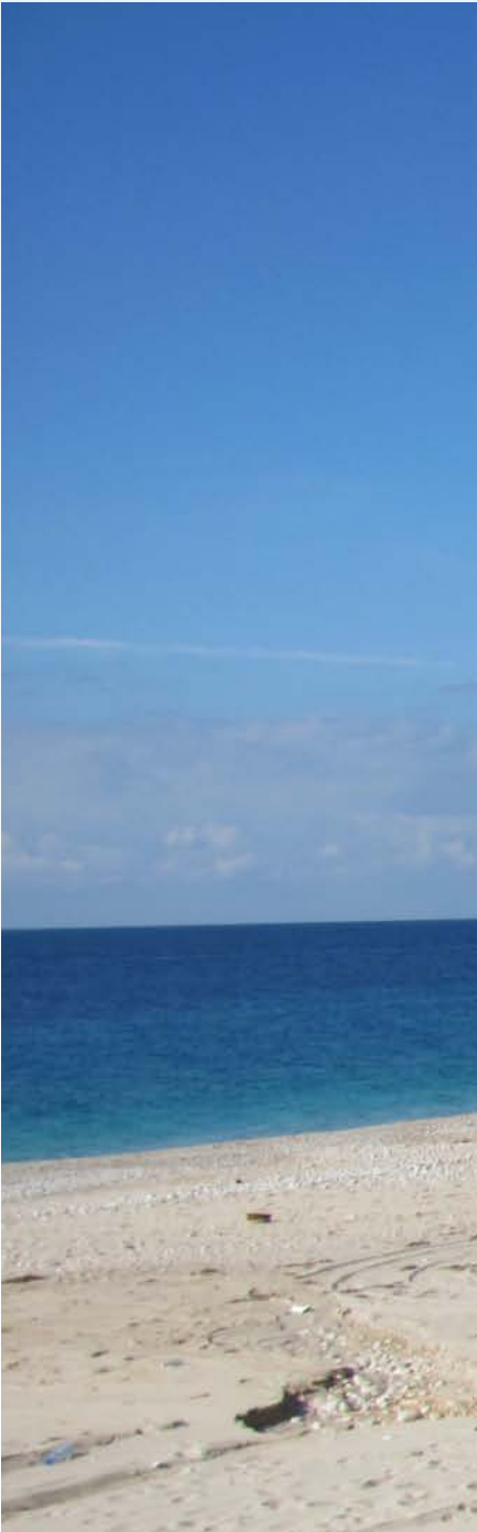
Beach in Vlorë