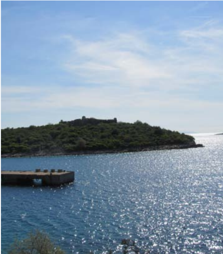
Ali Pasha castle in Porto Palermo

Porto Palermo has a well preserved castle that is commonly asserted by guide books and by the local tourist guides to have been built in the early 19th century by Ali Pasha of Tepelena, but most probably it was built by the Venetians as it has the same triangular plan with round towers found in the Venetian fort at Butrint. Moreover, the castle would have been vulnerable to cannonfire from the hill above and this also suggests an earlier date for its construction when cannons with a wide range were not yet developed. In 1803 Ali Pasha gave the castle and port to the Royal Navy.