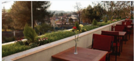
White Dream Hotel